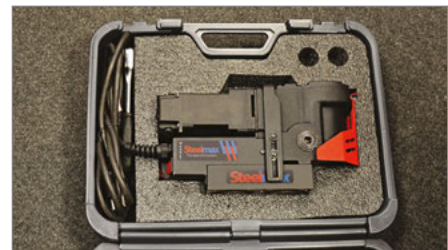
Handy plastic case