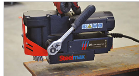
Lifting handle for easy transportation