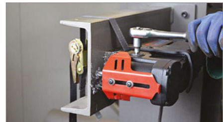
Easily work out of position