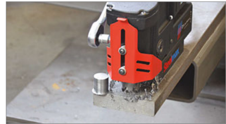
Max milling capacity up to 1-7/16" (36mm)