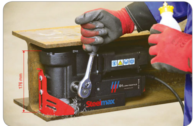
The D1 Low Profile fits in the tightest spots