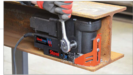
Compact design for height restricted areas. Detachable feed lever can be fixed from either side